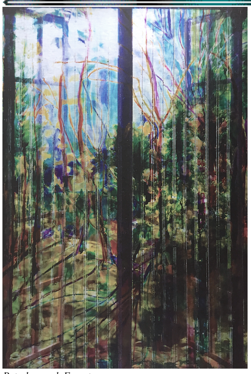
Peterborough Forest 2/2 in Edition 1, 2015, 11" x 14" Donna Cameron

Peterborough Forest and Tatiana Falls are cinematic compositions which explore landscape and biomorphic form in the life of the early spring forest. They were originally composed in the White Mountains in New Hampshire, USA. Each of the works is thematically unified but use different creative process. Both embrace the same theme, that of a local forest landscape; each is imaged in a unique way.